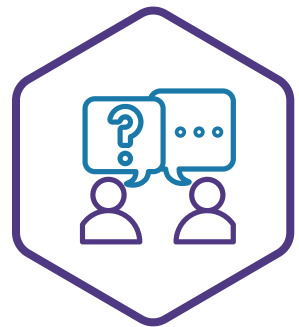
Recorded session on Interview preparation