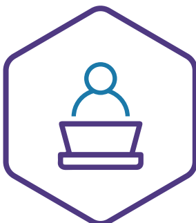
Recorded Guest Sessions