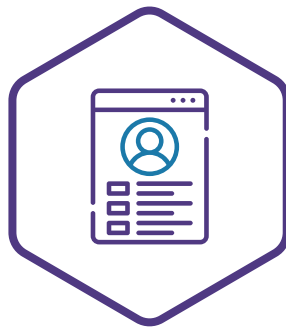
Recorded session on Resume building