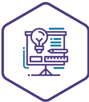
Recorded session on LinkedIn profile building