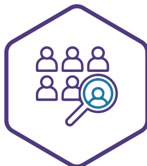
Navigating Job Search