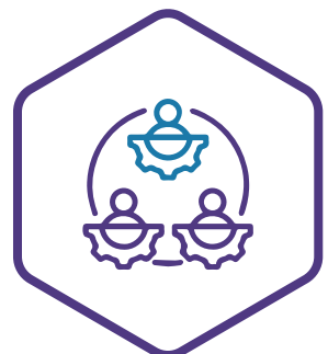
Job placement Assistance